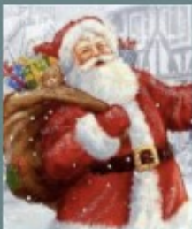
SANTA SLOTS ARE FOR ST MARY'S CHILDREN & SIBLINGS ONLY

PLEASE GET IN TOUCH SCHOOLASSOCIATION@CHARMINSTER.DORSET.SCH.UK